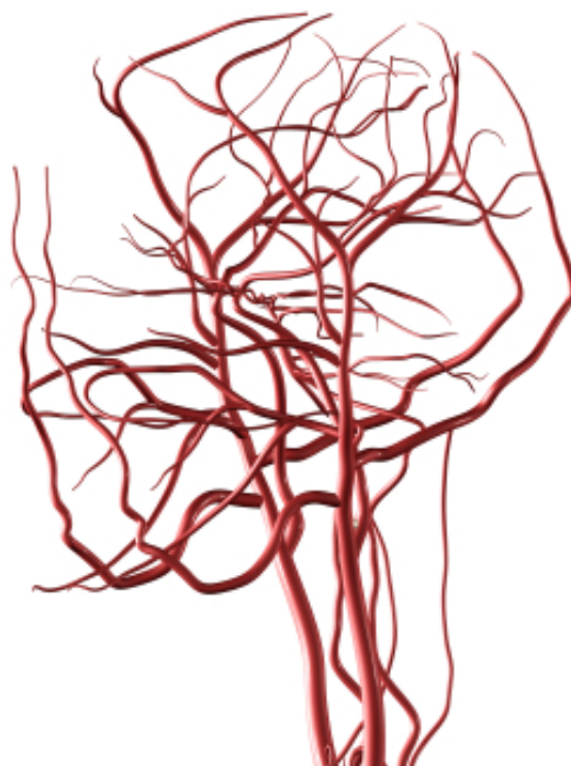
Figure 1: This figure is a representation of the head and neck arteries of the human body. Imagine the incredible volume of blood that the special blood vessels (arteriovenous anastomoses) can shunt from arteries into the small capillaries of your flush zones. The flush zone capillaries therefore take on a more heat regulatory function than a nutritive role.