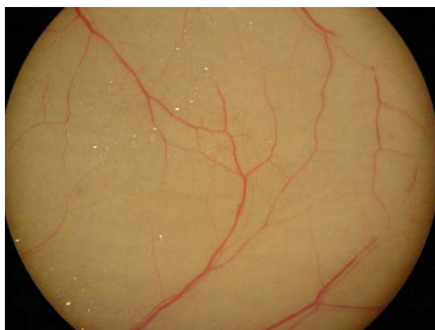
Figure 4: 4 MED was again administered to mice over a period of 30 minutes. However these mice were pre-treated with topical Silymarin & EGCG. You can see the potent inhibitory action of this combination on the UV induced vasodilation and growth of blood vessels.