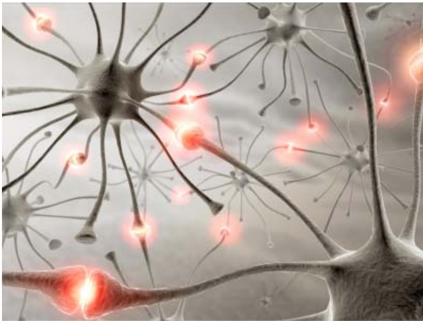
Figure 2: This figure is a representation of nerve conduction. The electrical connections result from the release of numerous neurotransmitters (short acting) and neuropeptides (long acting) crossing the nerve junctions. More inflammatory neurotransmitters and neuropeptides means more nerve activation. For flush zones of your skin this may mean more dilation of blood vessels and greater flushing.